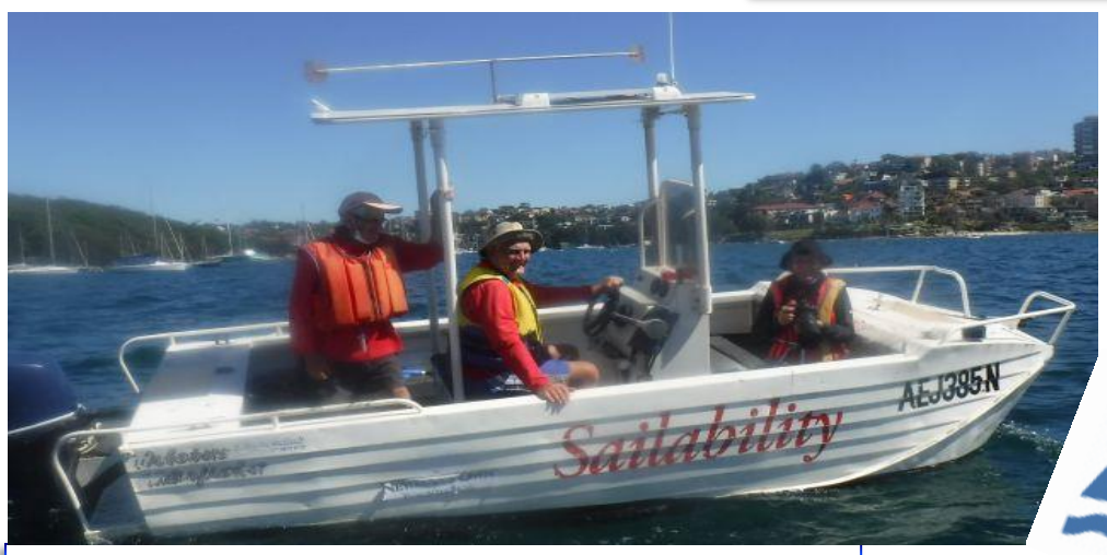
Support Boat Crew on Charlie's Chariot