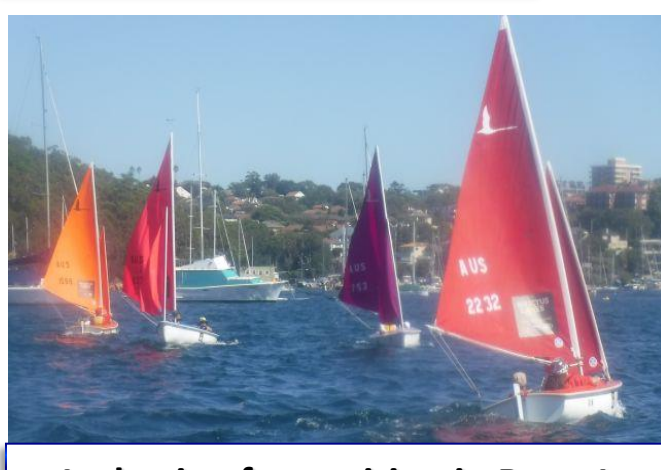
Jockeying for position in Race 1