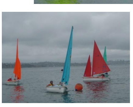
Merry Monday 29<sup>th</sup>