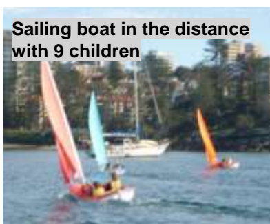
Sailing boat in the distance with 9 children