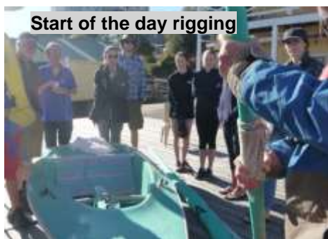
Start of the day rigging