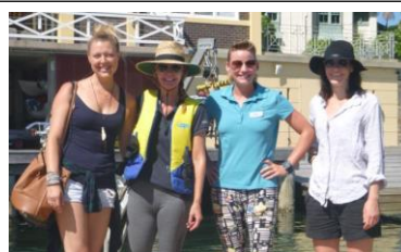
4 hard working ladies on the pontoon.