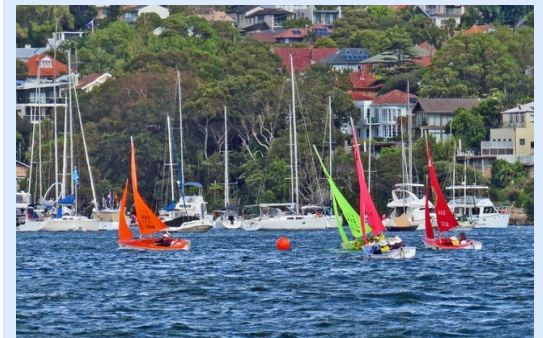
The fleet rounds the top mark