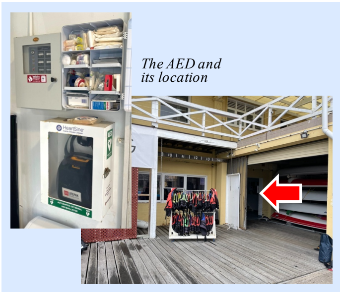
The AED and its location

In case of a medical emergency, there is an Automated External Defibrillator (AED) on the premises of Manly Yacht Club. All our volunteers and carers should note that it's stored opposite the stairs to the first floor, along with a well-stocked first aid kit.