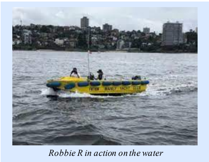
Robbie R in action on the water