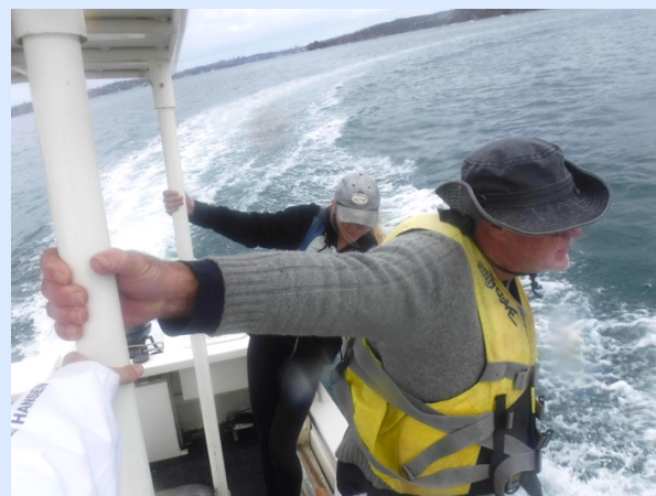
Sophie and Jim practice 'steering' Charlie's Chariot in case of steering breakdown – notice the curve of the wake!

If the steering breaks on a smaller motor boat like Charlie's Chariot, you can steer by shifting the crew's weight from side to side.