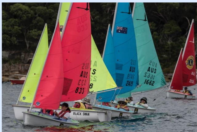
The race fleet flying over the start line