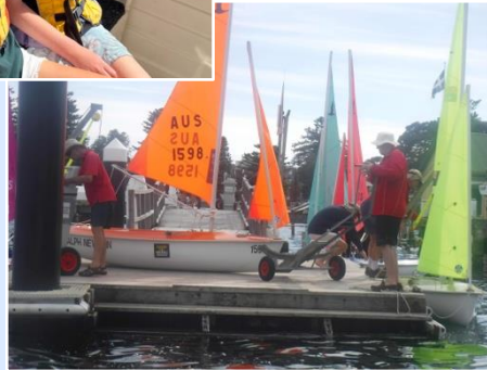
Our team setting up for a busy day

You can find full reports about each of our past sailing dates on our website, along with a selection of photographs, under LATEST NEWS.