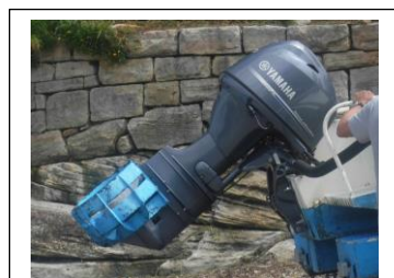
New Engine before it hit the water for the first time.