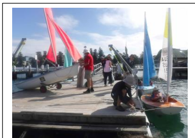
Our busy pontoon at the start of the day.

We really appreciate the helpers of these groups, who constantly care for their individual participants, join in the fun, and make our Sailability days a joy to hold.