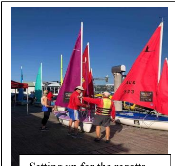
Setting up for the regatta