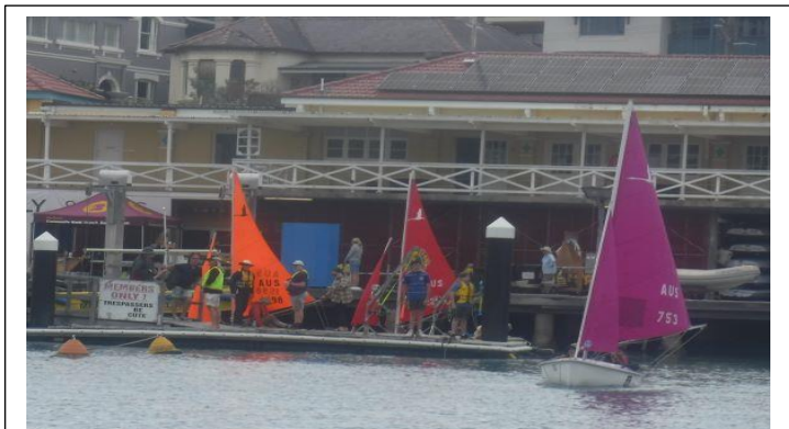
The busy Pontoon on Pirate Day.

Thank goodness the weather behaved perfectly for us this morning, and everyone left with a fabulous feeling of fun for a day in our busy lives.