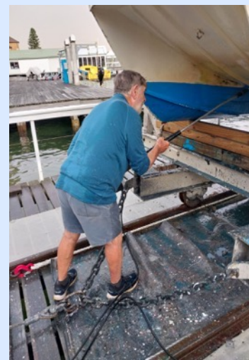
The maintenance team hard at work.