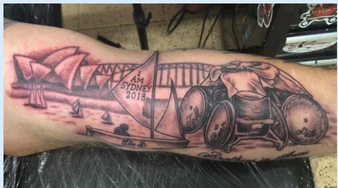
Bear's Invictus Games commemorative tattoo