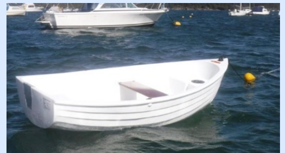
The new dinghy already in use.