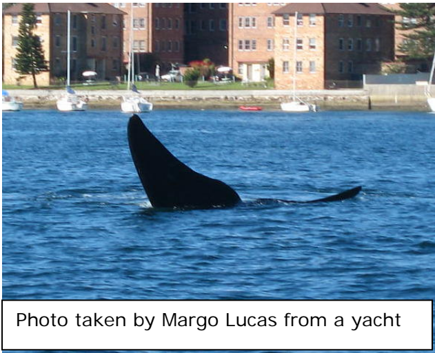
from a yacht